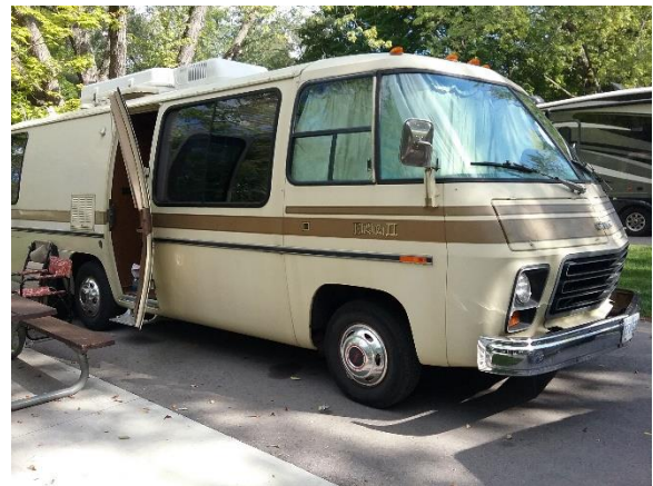
1976 Eleganza II